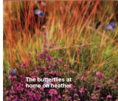
The butterflies at home on heather

It climbs a grass stem and, still protected by the ants, pumps up its wings before it is ready to fly. The Black Ant, Lasius niger , is crucial to the survival of this butterfly on Prees Heath, and so management of the habitat must cater for its needs as well.