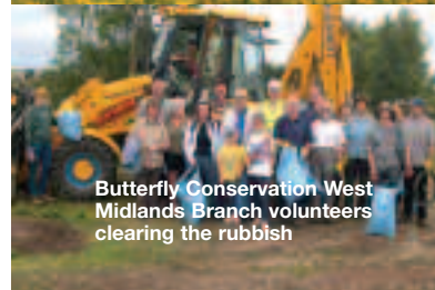
Butterfly Conservation West Midlands Branch volunteers clearing the rubbish

Existing remnants of heathland are threatened by birch and gorse scrub, and invasive plants have become established in places. The site has also suffered from fly-tipping and travellers' encampments for many years. The restoration work therefore also involves gradually clearing away what is not wanted or needed, and a Reserve Support Group, comprising Butterfly Conservation West Midlands Branch members and local volunteers helps undertake this vital work. An impressive start has been made, but a lot more remains to be done and new volunteers are always welcome. Thanks to your help, and the efforts of many supporters, this part of Prees Heath Common will be renewed.