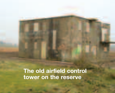
The old airfield control tower on the reserve

Certain parts of the reserve, principally those areas which were not subject to the cultivations that started in the 1970s, provide heathland and acidic grassland habitat for the Silver-studded Blue. These areas are legally protected as a Site of Special Scientific Interest.