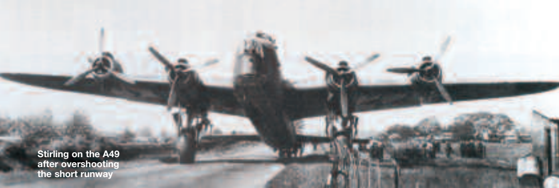
Stirling on the A49 after overshooting the short runway