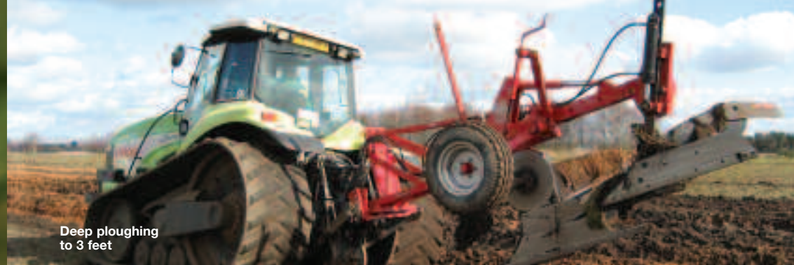
Deep ploughing to 3 feet