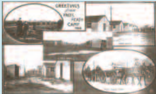
Above Postcard from 1916

After the war the airfield was decommissioned, although the concrete runway remained in place until the 1970s when it was broken up to prevent illegal motor vehicle use. Not all the pieces of concrete were removed however, and this prevented the runway and the perimeter road from being ploughed up in the same way as much of the rest of the site, thereby preserving some heathland habitat for the Silver-studded Blue.