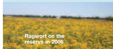
Ragwort on the reserve in 2006

The excess nutrients should be more readily lost from such a surface, providing much better conditions for heathland plants and grasses. Wildflower and grass seed of local provenance has been sown, and heather brash from Cannock Chase is being applied as a seed source. The project also includes plans to re-create an area of wetland, such as those that were drained when the airfield was built.