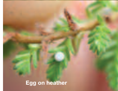
Egg on heather

Each adult butterfly lives for just a few days, and they rarely venture very far from where they emerged, spending their time mating, taking nectar from flowers and, in the evenings and in cooler weather, gathering in shrubs in communal roosts.