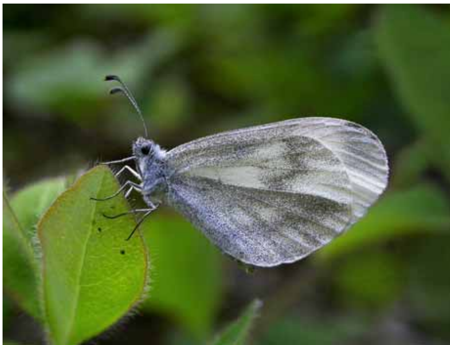
Wood White